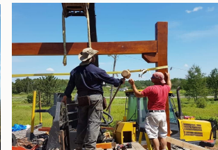
Building our future together