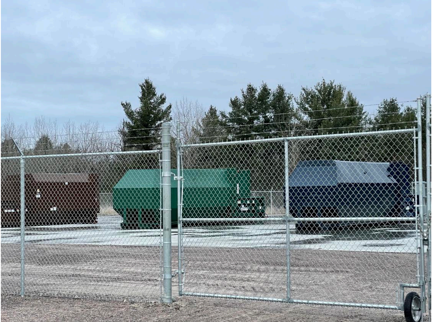
New Transfer Station...